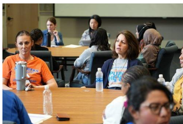
Participants at an Interpersonal Education event